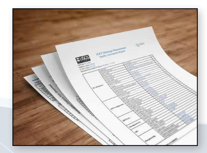
Figure 1: Tables 1 and 2: Q-View 2.1 report including a measurement summary and measurement quality score