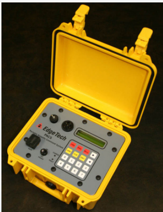
PACS Deck Box for acoustic command and control of the CATS

The Coastal Acoustic Transponder (CAT) is ideal for deployments in coastal environments. The acoustic command structure is the same as that used in all of our underwater acoustic releases and transponders and is unsurpassed in multi-path environments.