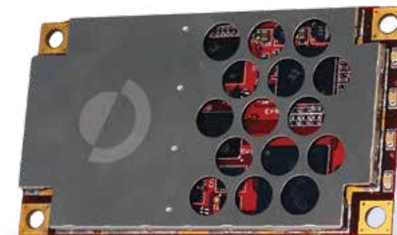
* Board is actual size