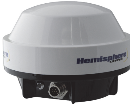
Figure 1-1: A325 smart antenna

Note: Throughout the rest of this manual, the A325 Smart Antenna is referred to simply as the A325.