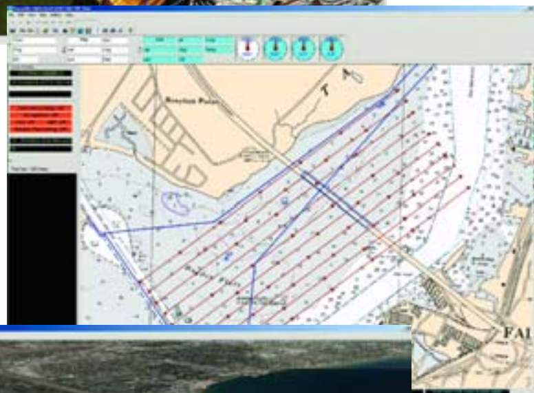
Survey Line Set-up

Advanced Contact Management and Reporting