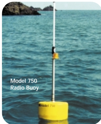
Model 750 Radio Buoy

The units can be powered externally. Input voltage range 12 to 30 VDC.